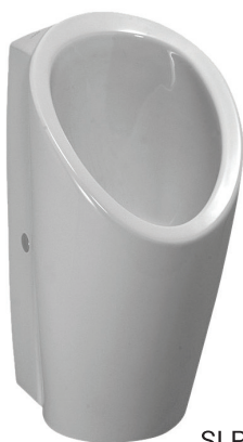
SLP 59 - LEMA